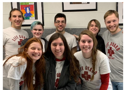
All our full time staff and even some extra help were needed at this huge Good News Club!

This is the Newsletter of CEF Bucks-Mont, but did you know each of our full time and summer missionaries send out newsletters too? If you're interested in hearing the stories of a CEF missionary this year, now is a great time to start! If you would like to receive a missionaries newsletter, you can head to bucksmontcef.com to view a list of our full time missionaries. You can fill out the contact form on our website and ask that we send you the newsletter for any full time missionary, or that we keep you in mind during the summer as someone who would like to hear the stories of our summer missionaries! As always, we thank you for your faithfulness and interest in our ministry as we spread the gospel throughout Bucks and Montgomery County!