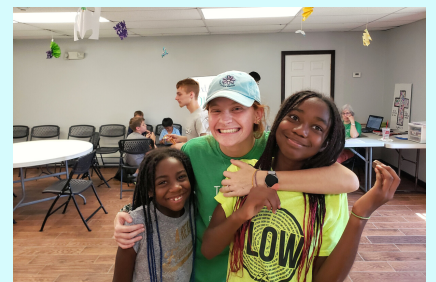
Tell a friend today about Camp Good News!