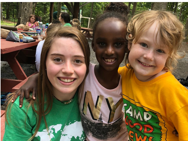
Campers enjoying Camp Good News!

This summer, we plan to prioritize and focus on our Camp Good News ministry. As long as our government allows child care organizations to resume, Camp Good News will be open! We look forward to providing engaging, educational childcare for families this summer. Through our camp scholarships, we also hope to bless families who are struggling financially in the wake of the pandemic. Our main goal in Camp Good News is to clearly share the good news of the gospel. We want to encourage campers that despite anything going on around us, we can trust that God is in control. The curriculum planned for this summer takes the children through Jesus' earthly ministry. In sharing these Bible lessons, our desire is that children would come to a saving knowledge of Jesus and live their lives for Him.