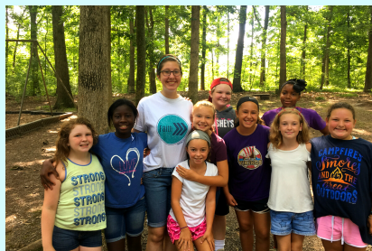
A girls small group at Camp Good News!